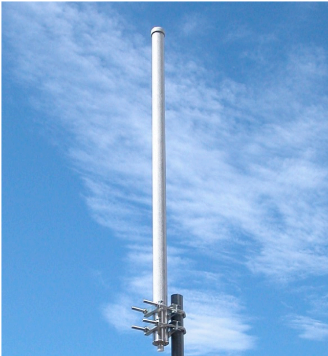
Shipped Direct from Manufacturer

One Year Warranty, Repair or Replacement, Provided by Manufacturer