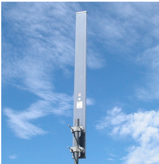
Shipped Direct from Manufacturer

One Year Warranty, Repair or Replacement, Provided by Manufacturer