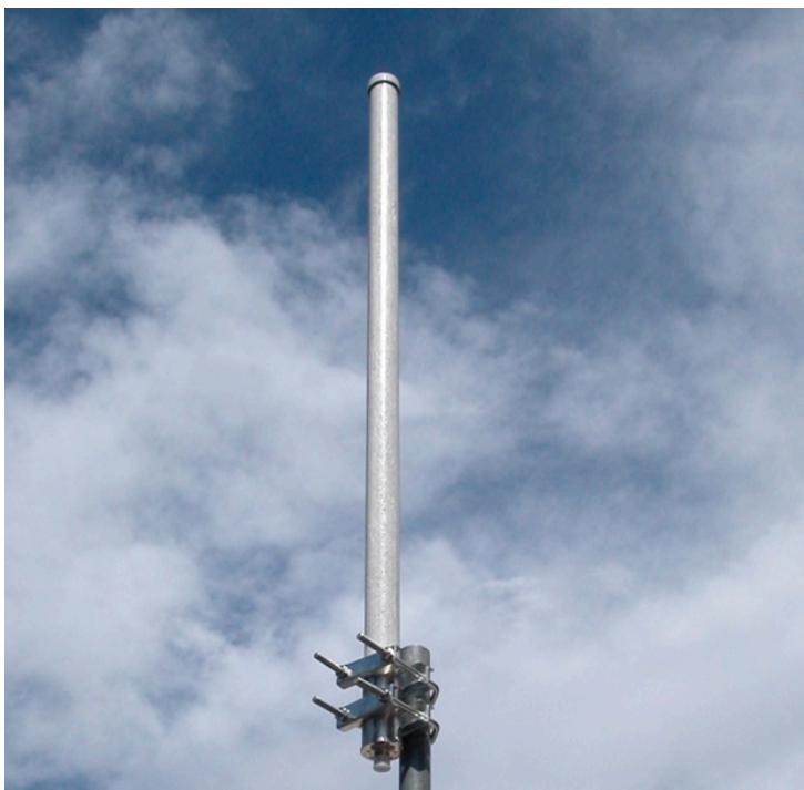
Shipped Direct from Manufacturer

One Year Warranty, Repair or Replacement, Provided by Manufacturer